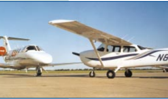
The KSUS College of Technology and Aviation trains with a modern fleet of nearly 40 aircraft including Cessna 172s, Beech Bonanzas, Beech Sundowners, Beech Barons, a Beech King Air, and a Cessna Citation Jet.